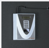
Biometric access control system