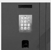
Biometric access control system